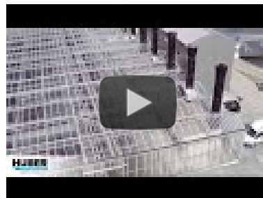
Video: HUBER Sludge Turner SOLSTICE®

https://www.youtube.com/watch?v=gOkKQhmA4uM