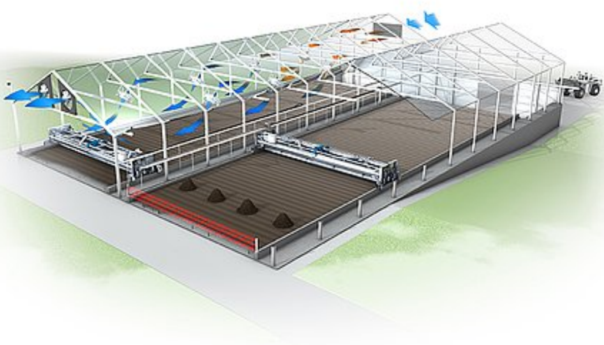
Design sketch: Sludge drying with solar energy