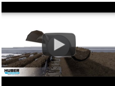
Animation: HUBER Sludge Turner SOLSTICE® for large quantities of sludge

https://www.youtube.com/watch?v=T-FUbjSzMZE