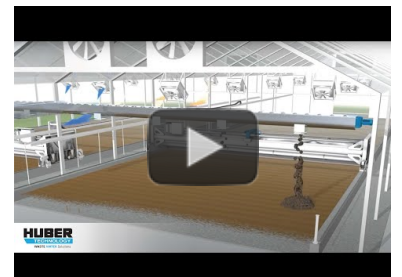
Animation: HUBER Sludge Turner SOLSTICE®

\label{eq:https://www.youtube.com/watch?} $$v=T-FUbjSzMZE$