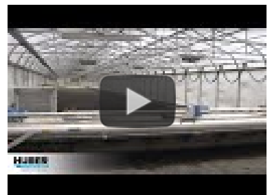
Video: Solar Active Dryer SRT at STP Marktbergl

https://www.youtube.com/watch? v=JqflpsD16VM