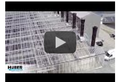
Video: HUBER Sludge Turner SOLSTICE®

https://www.youtube.com/watch? v=gOkKQhmA4uM