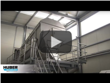
Video: HUBER Grit Treatment System RoSF 5 in disposal industry

https://www.youtube.com/watch?v=a2fl9eGOEsk