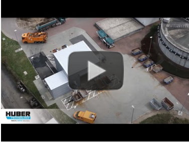
Video: HUBER Grit Treatment System RoSF5 at WWTP Frankfurt-Niederrad

https://www.youtube.com/watch?v=ZVP2aWdm9AE