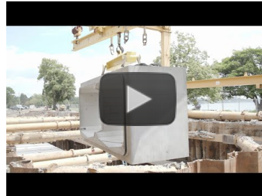
Three Projects, One Goal: Highlighting Stormwater Management in New England

https://www.youtube.com/watch?v=MGrAG0bs4xQ