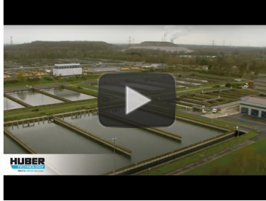
Video: HUBER Grit Treatment System RoSF 5 at major WWTP "Emschermündung"

https://www.youtube.com/watch?v=ZVP2aWdm9AE