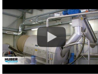
Video: HUBER Grit Treatment System RoSF 5 - grit recycling at WWTP Schwarzenberg

https://www.youtube.com/watch?v=SpqklL361Sc