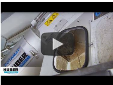
Video: HUBER Rotary Drum Fine Screen ROTAMAT® Ro2 for municipal inlet screening https://www.youtube.com/watch?v=vylieOQUR_9o