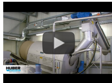
Video: HUBER Rotary Drum Fine Screen ROTAMAT® Ro2 in a grit treatment process for wash-out of organics https://www.youtube.com/watch?v=a2fl9eGOEsk