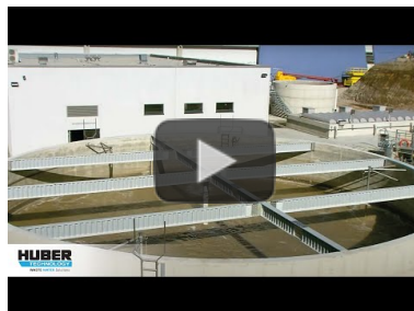
Video: HUBER Rotary Drum Fine Screen ROTAMAT® Ro2 for preliminary wastewater treatment in meat processing industry https://www.youtube.com/watch?v=HvwV0BaLd68