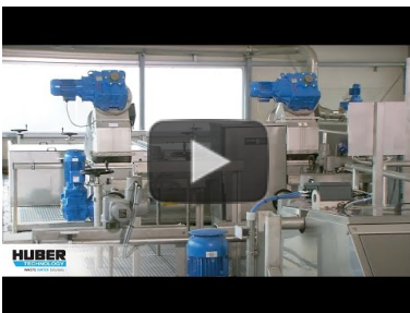
Video: HUBER Membrane Screen ROTAMAT® RoMem - here at a municipal WWTP https://www.youtube.com/watch?v=YsFSSEnSAMs