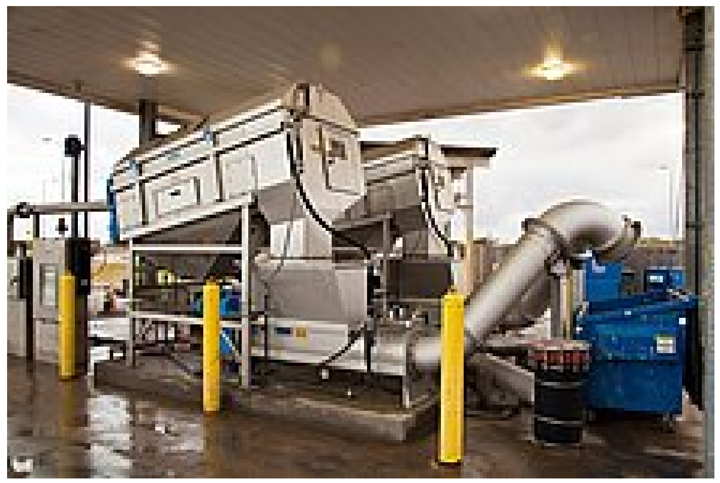
HUBER Sludge Treatment products in the San Antonio receiving station process

Home HUBER Report Sludge Treatment HUBER's Sludge Screens Help SAWS Receiving Stations Handle Deliveries