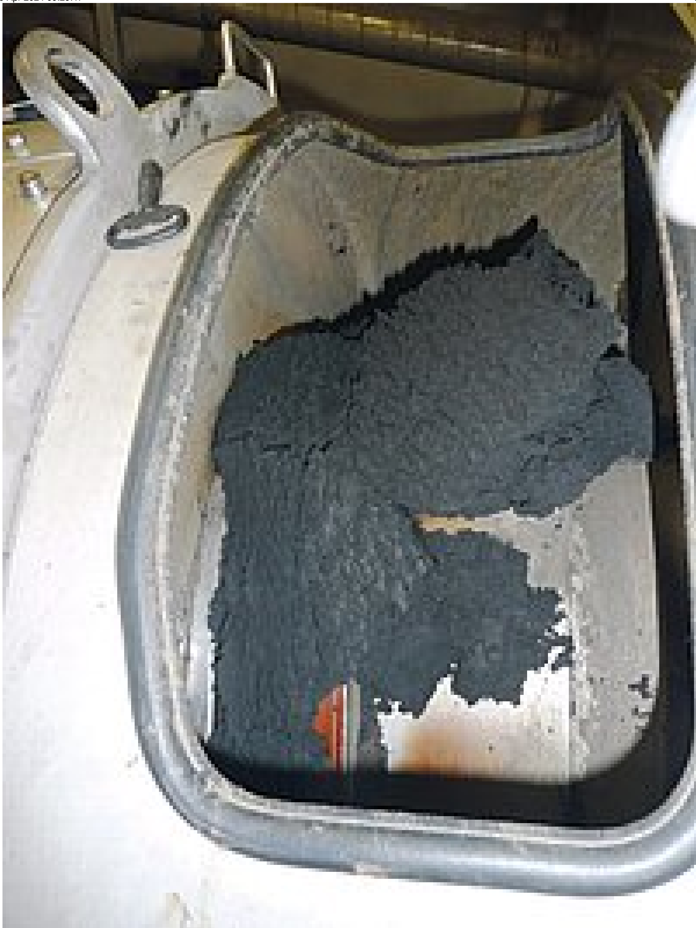
Dewatered sewage sludge from the RoS 3Q 620 screw press

It remains to be seen in how far maintenance costs will decrease in Hämeenlinna which were the decisive factor for the customer to buy the HUBER product. On the basis of the experience we have made over many years with our ROTAMAT® Screw Press RoS 3Q units, however, we expect savings of 70 to 80% compared to the centrifuges.