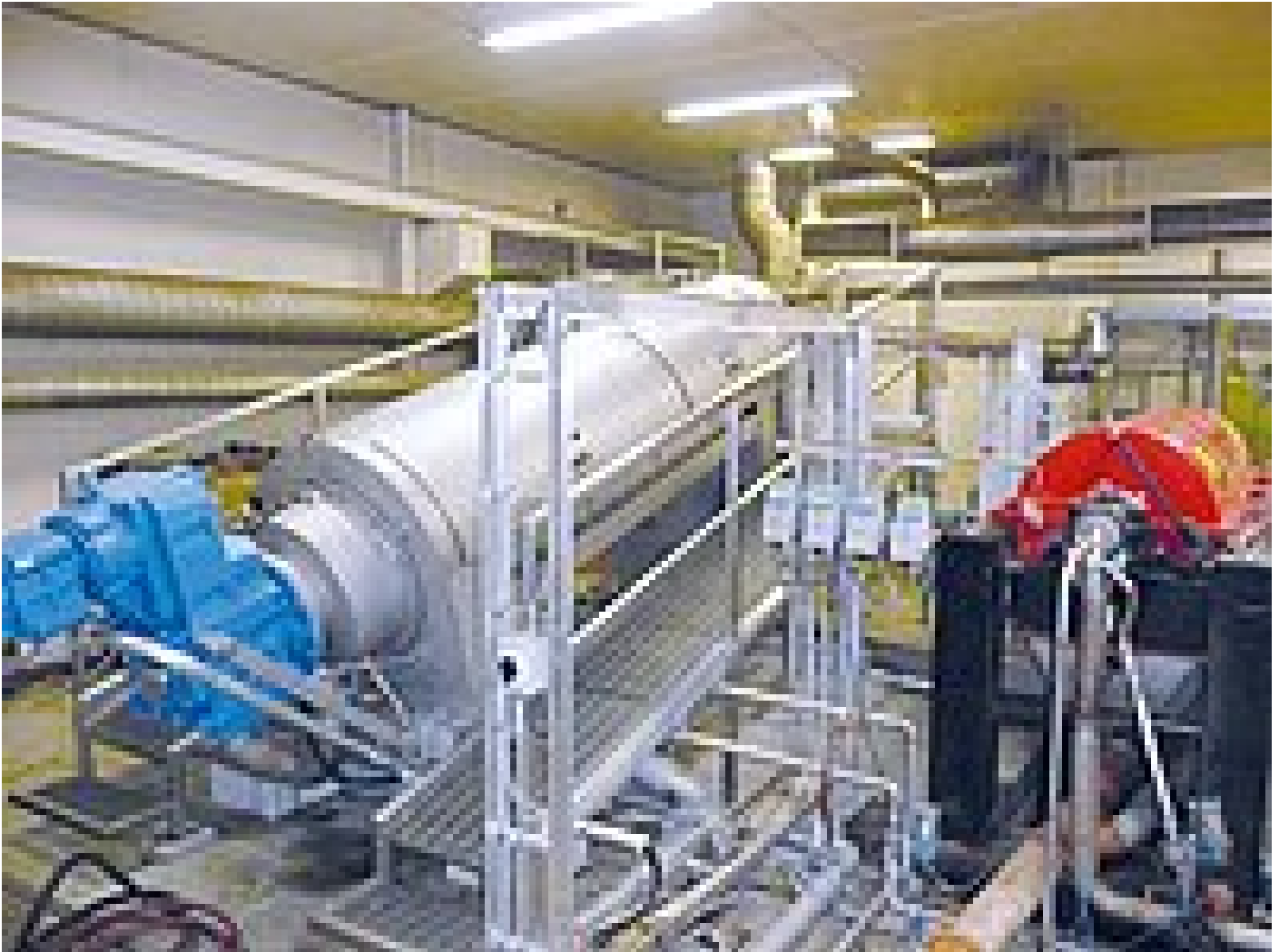
Screw Press RoS 3Q 620 beside the maintenance-prone decanter