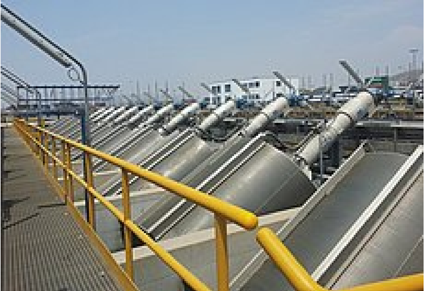
Several HUBER ROTAMAT® screens installed directly in the channel of the STP