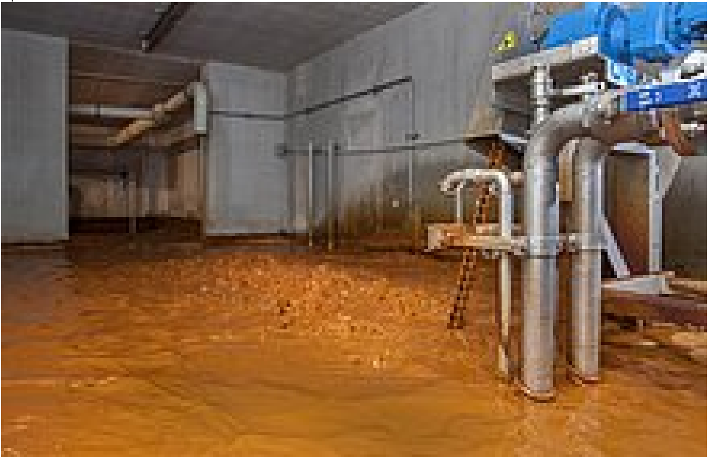
Fig. 4: MBR plant with a HUBER Membrane Filtration VRM@ 30/18 RF in one filtration chamber