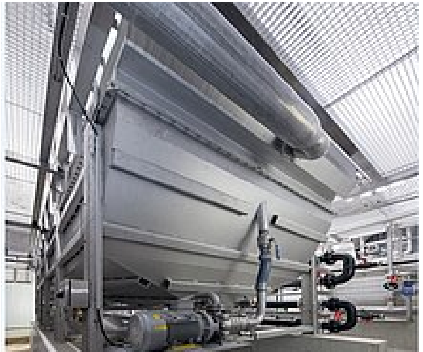
Fig. 3: HUBER Dissolved Air Flotation Plant HDF S 20