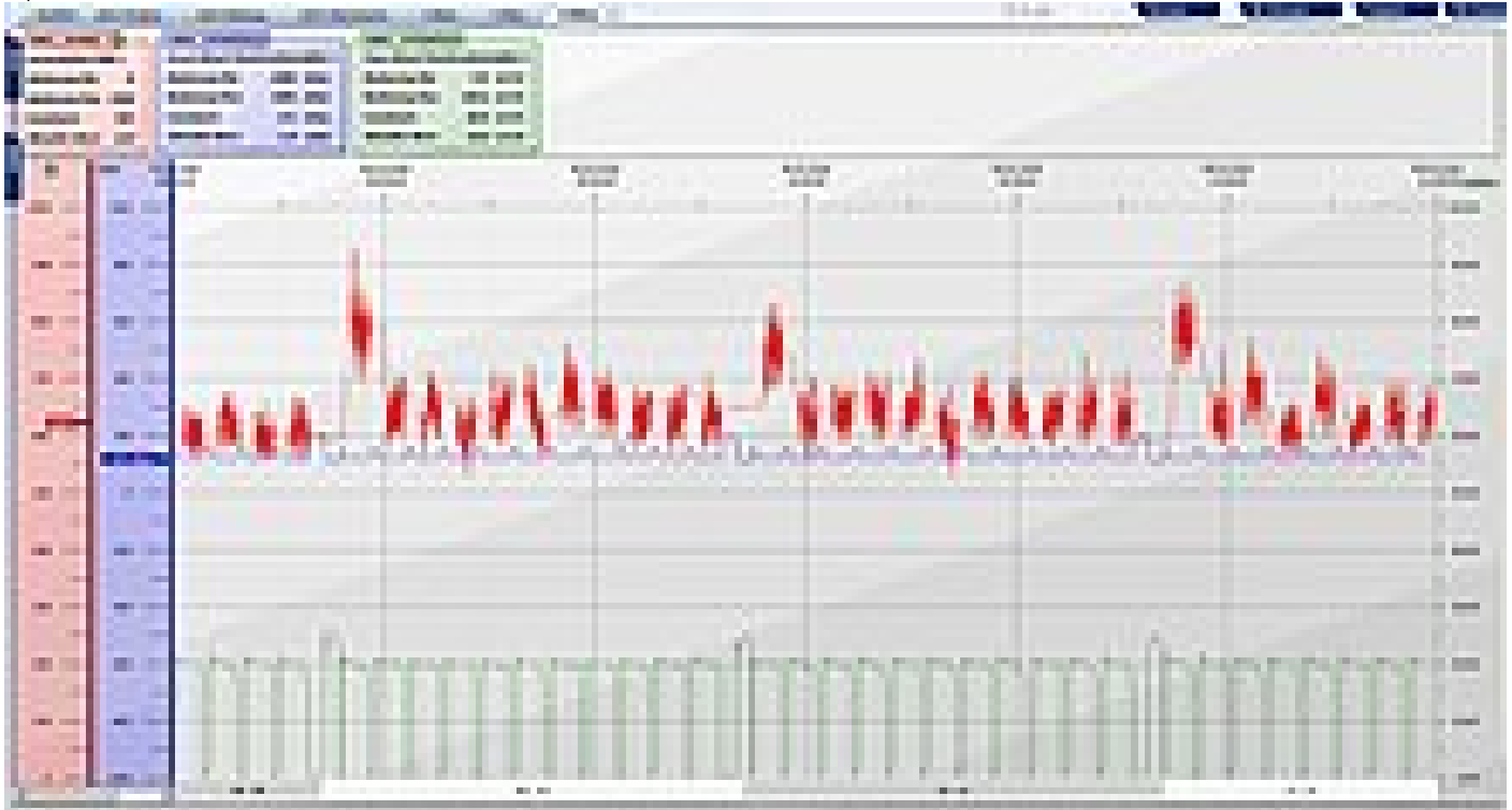
Fig. 7: Part of the process control system, visualisation of the membrane filtration plant ; red: permeability curve