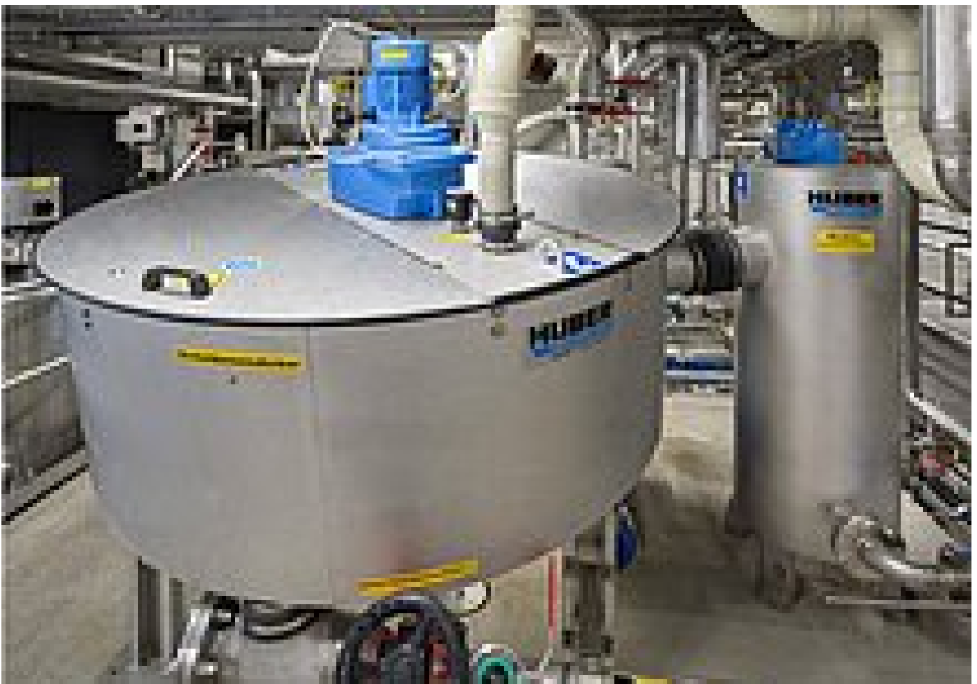
Fig. 5: Thickening of flotata and excess sludge with a HUBER Disc Thickener S-DISC

can completely be treated on the company site while the production wastewaters are still passed on to the municipal sewage plant that needs these volumes to work efficiently. In case of necessity, the total wastewater can be introduced into the sewer network.