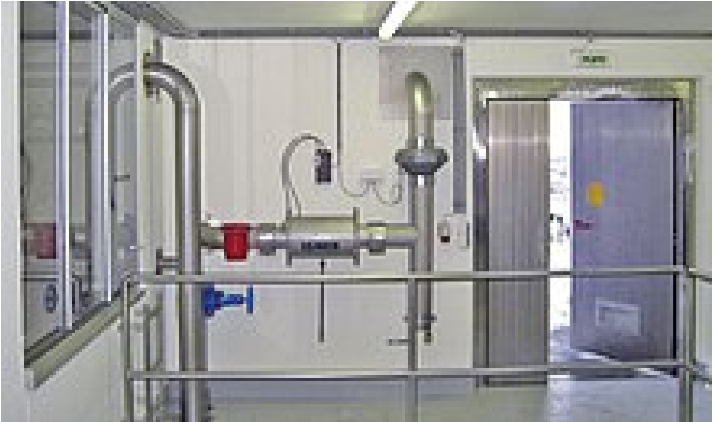
Installation example of "active forced ventilation" in the elevated reservoir Utzenaich, Austria

Drinking water supply structures are in most cases erected by construction companies as principal contractor. When construction companies receive the order for building a drinking water reservoir, they need a partner who can supply both high-quality products and the expertise required to provide economical solutions with maximum customer satisfaction.