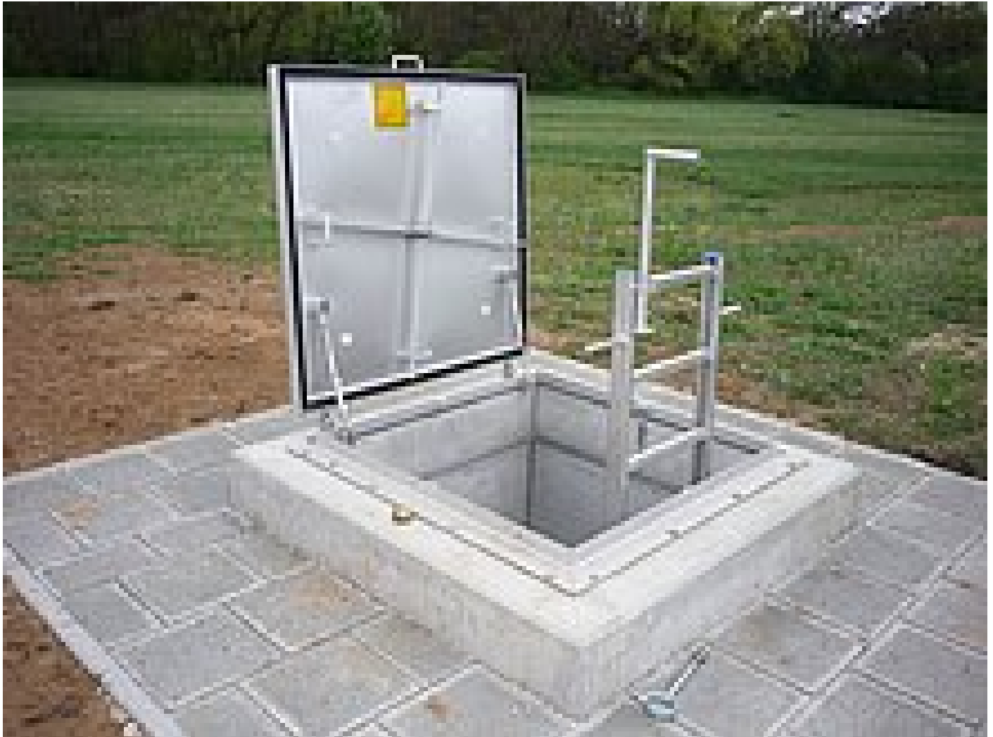
Newly refurbished manhole

The regular inspection of installations is an important aspect not to be underestimated where drinking water and wastewater structures need to be maintained as valuable elements of our supply and disposal networks.