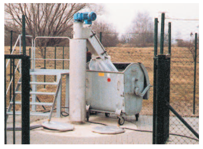
Thermally insulated and heat-traced unit

A few examples, selected from overone hundred RoK 4 installations.