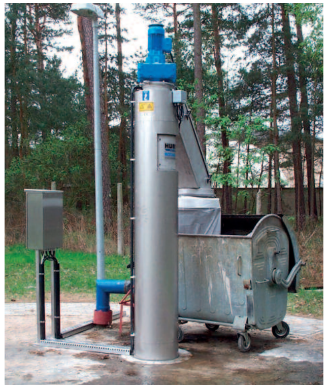
Screenings discharge into a bagger