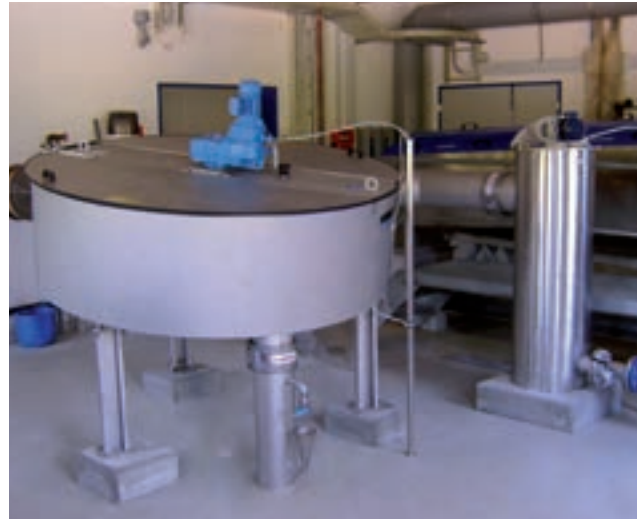
HUBER Disc Thickener S-DISC size 2 with preceding flocculation reactor.