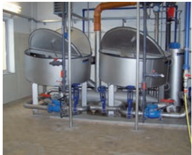
Two units installed in confined space.