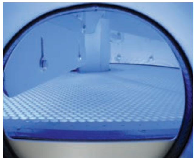
Wear-resistant stainless steel filter cloth.