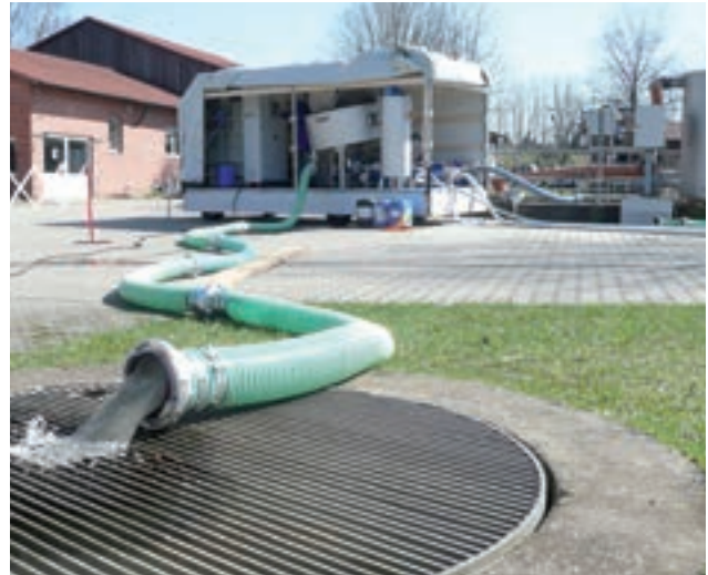
Mobile HUBER Disc Thickener S-DISC mounted on a car trailer, clear filtrate water runs off in the foreground.