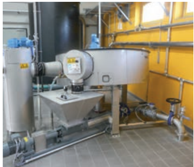
HUBER Disc Thickener S-DISC designed to thicken 35 m 3 /h.