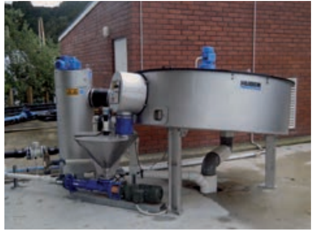
Außenaufstellung eines HUBER Scheibeneindickers S-DISC.