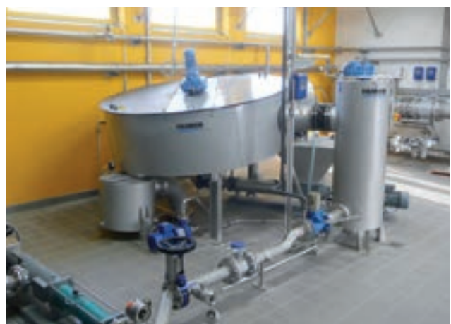
Filtrate storage tank and spray water pump for water recycling.