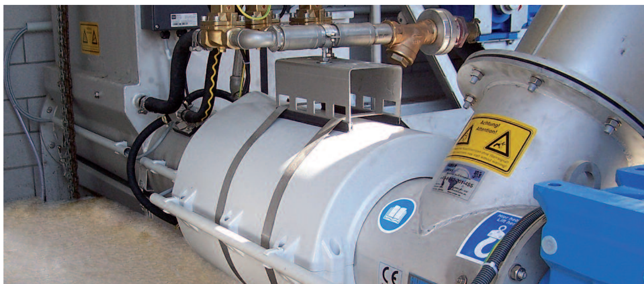
HUBER Screenings Compactor Ro7 – compact design, with optional screenings washing