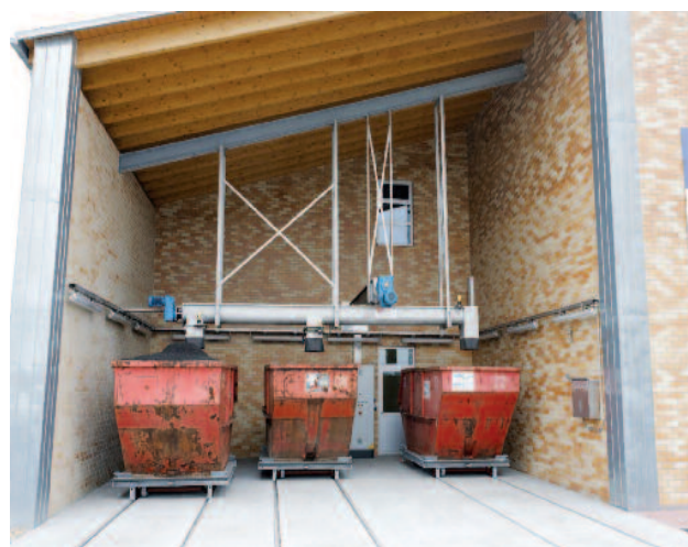
Dried material storage as required for the selected sludge disposal option