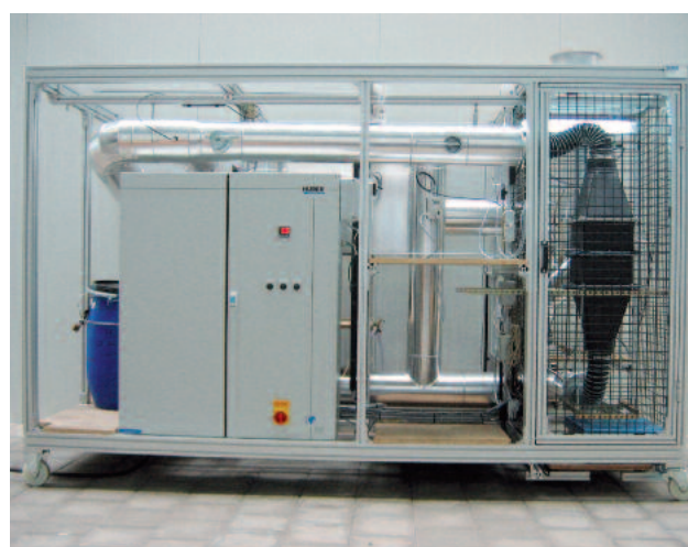
Small unit – high design security