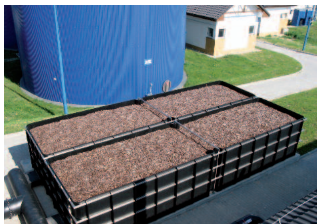
Exhaust air treatment designed to meet specific customer requirements

HUBER – expertise and experience in the entire field of sludge treatment provided by a professional partner.