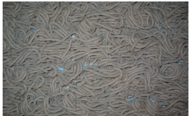
Porous sludge layer on the belt riding slowly and gently through the dryer; no mechanical stress is applied and virtually no dust generated