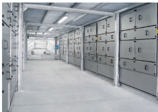
Reliable operation and easy maintenance