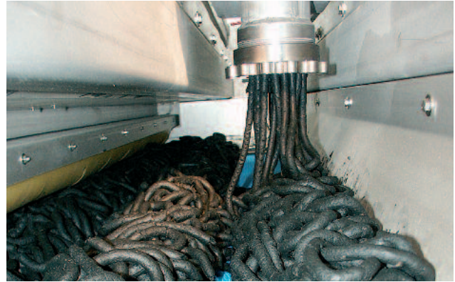
Sludge feeding through our extruder is essential for the outstanding performance of our belt dryers

Our plant components are selected on the basis of their high availability and high quality of individual parts. The modular design of HUBER belt dryers permits to adapt them to meet specific customer requirements.