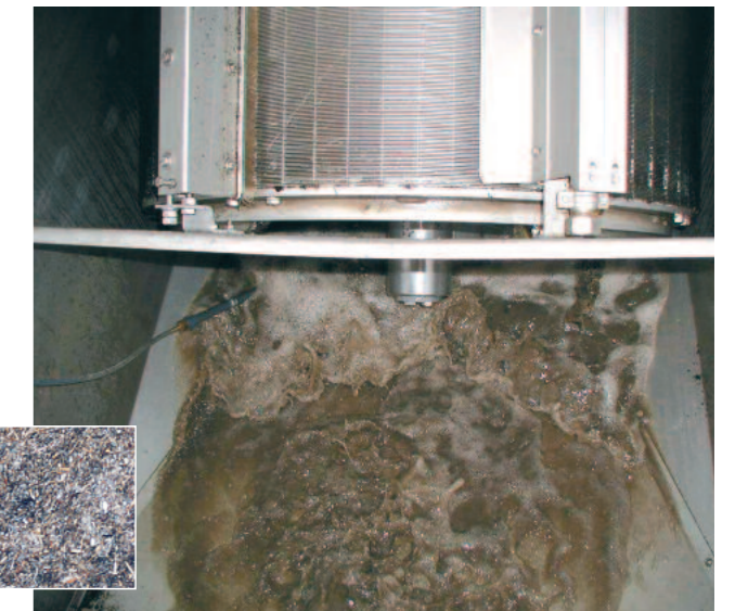
ROTAMAT® fine screen for 1 mm screening and dewatering of organic material (approx. 30 % DR)