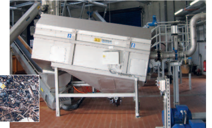
ROTAMAT® Wash Drum for washout and separation of all coarse material > 10 mm