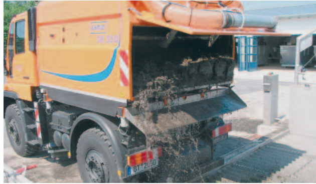
Acceptance tank with bar grate and integrated horizontal dosing screw