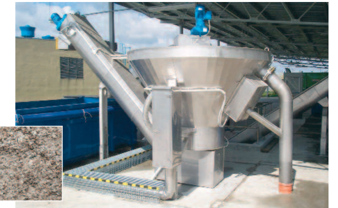
Washed grit from COANDA Grit Washer with < 3% loss on ignition, particle size up to 10 mm, DR > 90%