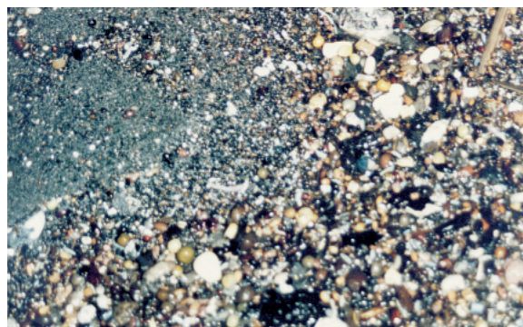
Untreated grit from STPs