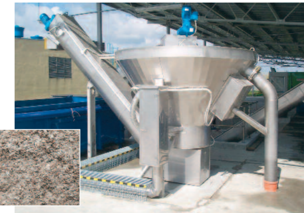
Washed grit from COANDA Grit Washer with < 3% loss on ignition, particle size up to 3/8" (10 mm), DR > 90%