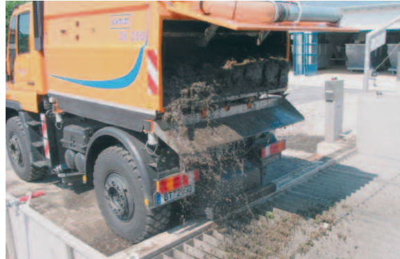
Acceptance tank with bar grate and integrated horizontal dosing screw