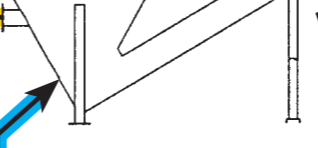
grit classifying and washing