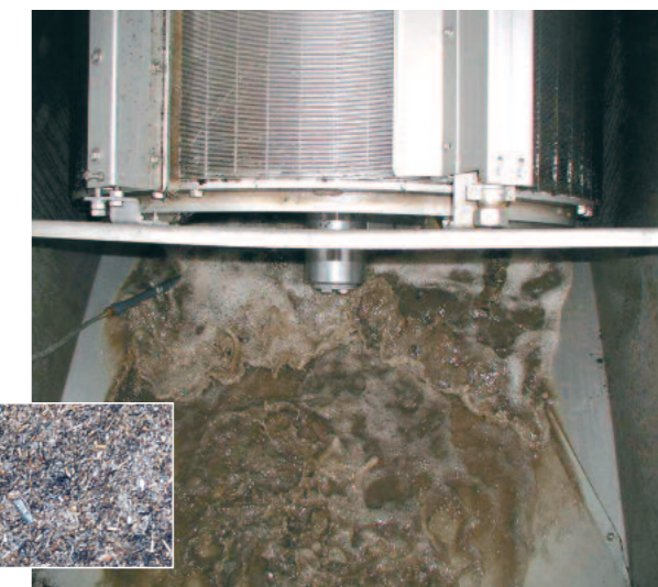
ROTAMAT® fine screen for 1 mm screening and dewatering of organic material (approx. 30 % DR)