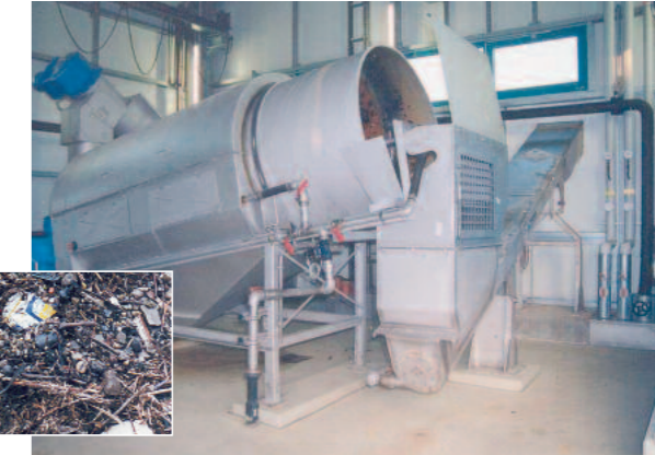
ROTAMAT® Wash Drum for washout and separation of all coarse material > 3/8" (10 mm)